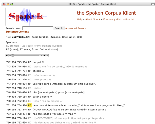
Figure 2: Screenshot of the Context screen

For each context in the result list, Spock provides a link to a page containing a larger stretch of the context of that match. The context page provides not only the matching prosodic element itself, but also a number of elements before and after it, as well as the complete sound fragment of that larger context (see figure 2). This makes it possible to look at and listen to the larger context of the matching element, in order to, for instance, disambiguate a word or sentence, or compare the pitch, tone, and speech of the element to the surrounding discourse units.