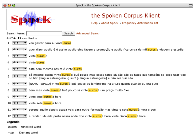
Figure 1: Spock screenshot with result for euros

line shows a matching context, with the word euros highlighted. In front of every context line, Spock provides a button, which will play the audio fragment corresponding to the context behind it.